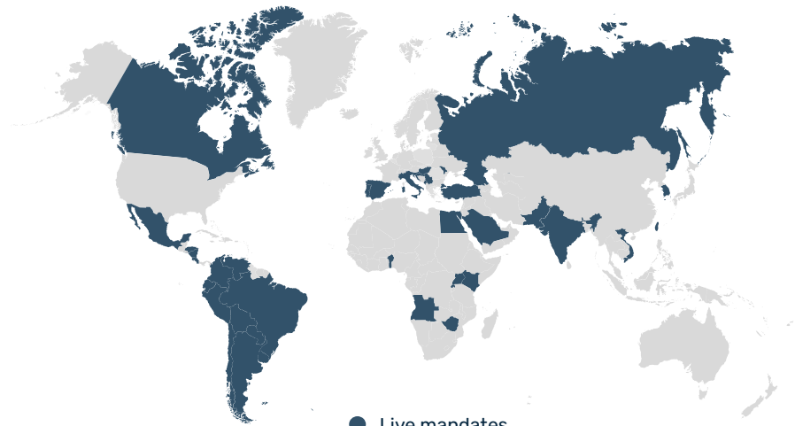
● Live mandates