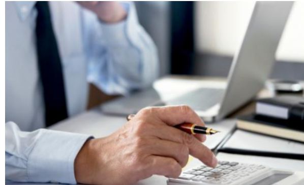
Confusion with micro accounts. You can have two, what to pay for them?