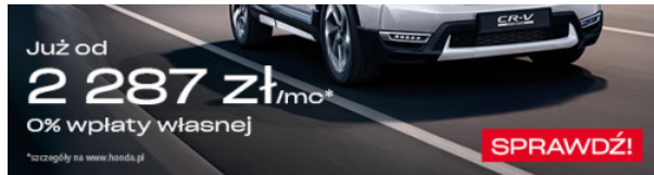
Check the car for fans of dynamic and smooth driving