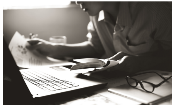
Anti-crisis shield 2.0: How does exemption from ZUS contributions translate into ...