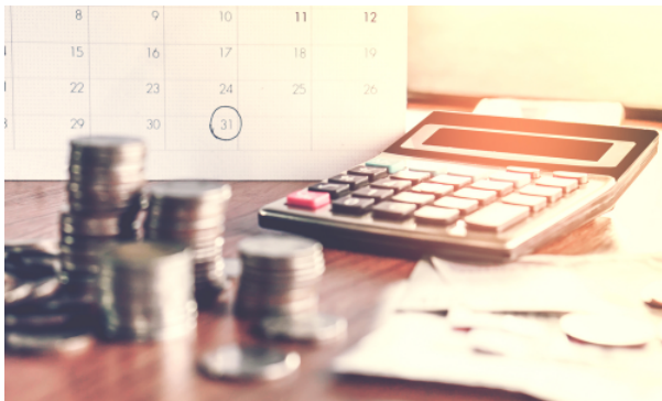
Facilitations for taxpayers in the anti-crisis shield [STATEMENT]