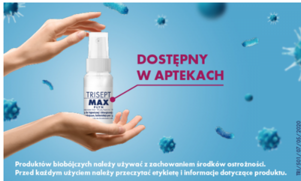
Do you want to take care of your hand hygiene even better? Check!