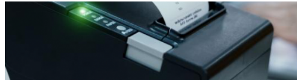
Changes in regulations in 2020 A receipt must have a tax identification number to exchange it for an invoice