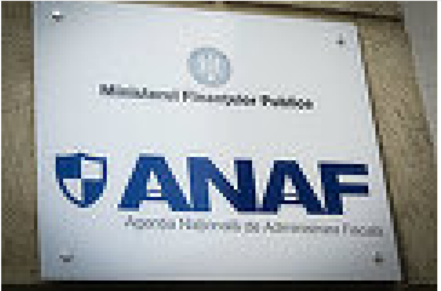
ANAF modernizes on EU money despite politicians - CNIF prepares two other IT projects on European money on

AUD 2.9302 0.0156 ▲ BGN 2.4386 0.0013 ▲ BRL 1.0103 0.0028 ▲ C/