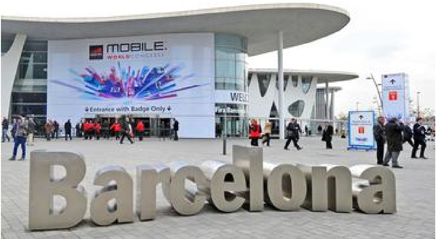
Mobile World Congress 2020 could be canceled