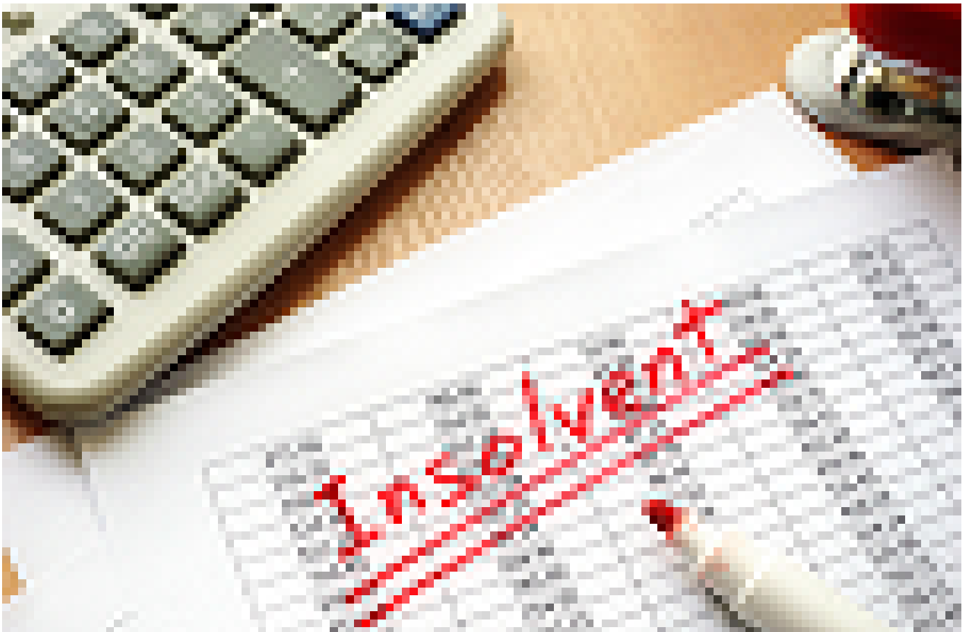
INFOGRAPHIC Increases the number of non-payment incidents. The most affected sectors - pharmaceuticals, distribution and construction