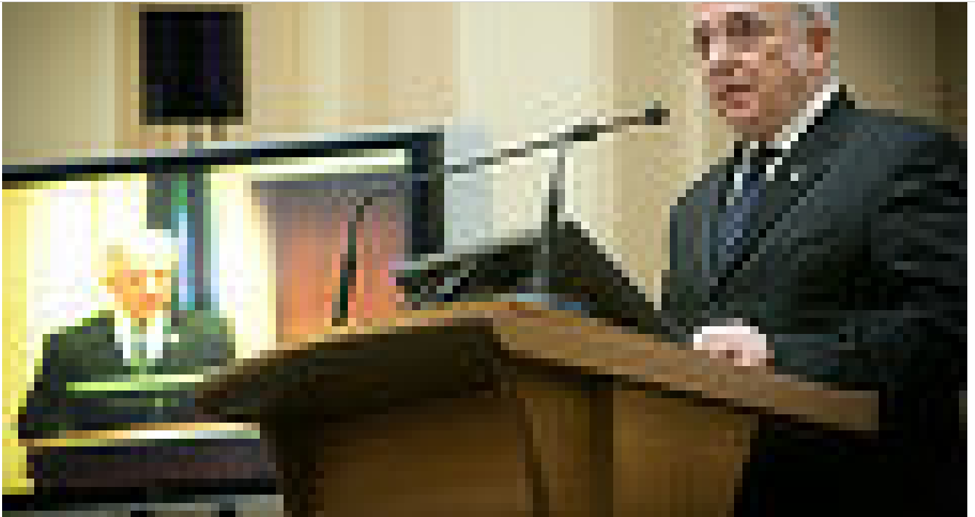
Isarescu, about raising pensions promised by politicians over a budget deficit: The question to be asked is where do you borrow this money and at what costs

HRK 0.6400 0.0006 ▲ 100 HUF 1.4112 -0.0002 ▼ NR 0.0613 0.0003 ▲ 1C