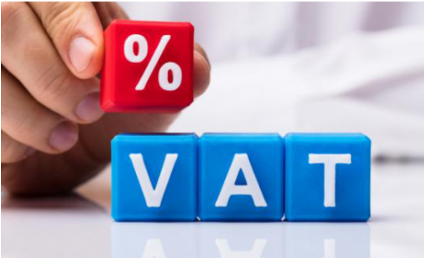
New VAT rates 2020: Check what will change after April 1, 2020.