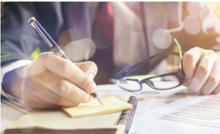
Changes in taxes in 2020: CIT and PIT